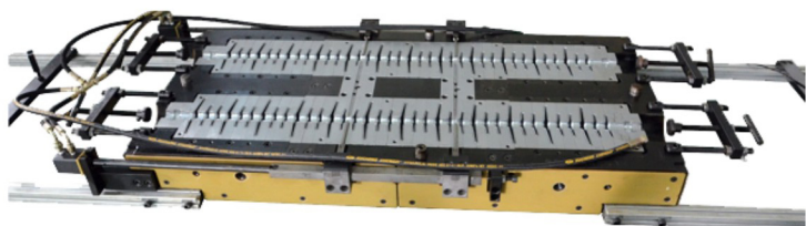
HTV SUSPENSION INSULATOR MOULD 固体胶悬式绝缘子模具