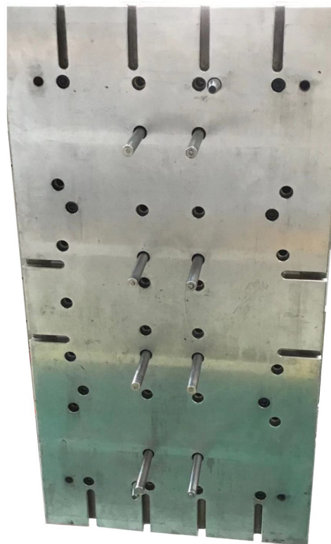
CRB(COLD RUNNER BLOCK) 冷流道